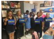
Cope With Hope Join Closed Group

www.Easterseals-swfl.org www.AbaAcademySarasota.org