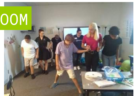
Friday Ballroom Dance Instruction with Dynasty Dance T-A-N-G-O!

Keeping the positive praise going is easy to do, as the Green Room kids are so diligent, caring and determined. Though separately the kids come in with varying needs and abilities, together they comprise a beautiful team. Aristotle said, "We are greater than the sum of our parts." This is definitely true of our Green room kids, here at Easterseals ABA Academy!