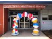
Kids Night Out Join Closed Group